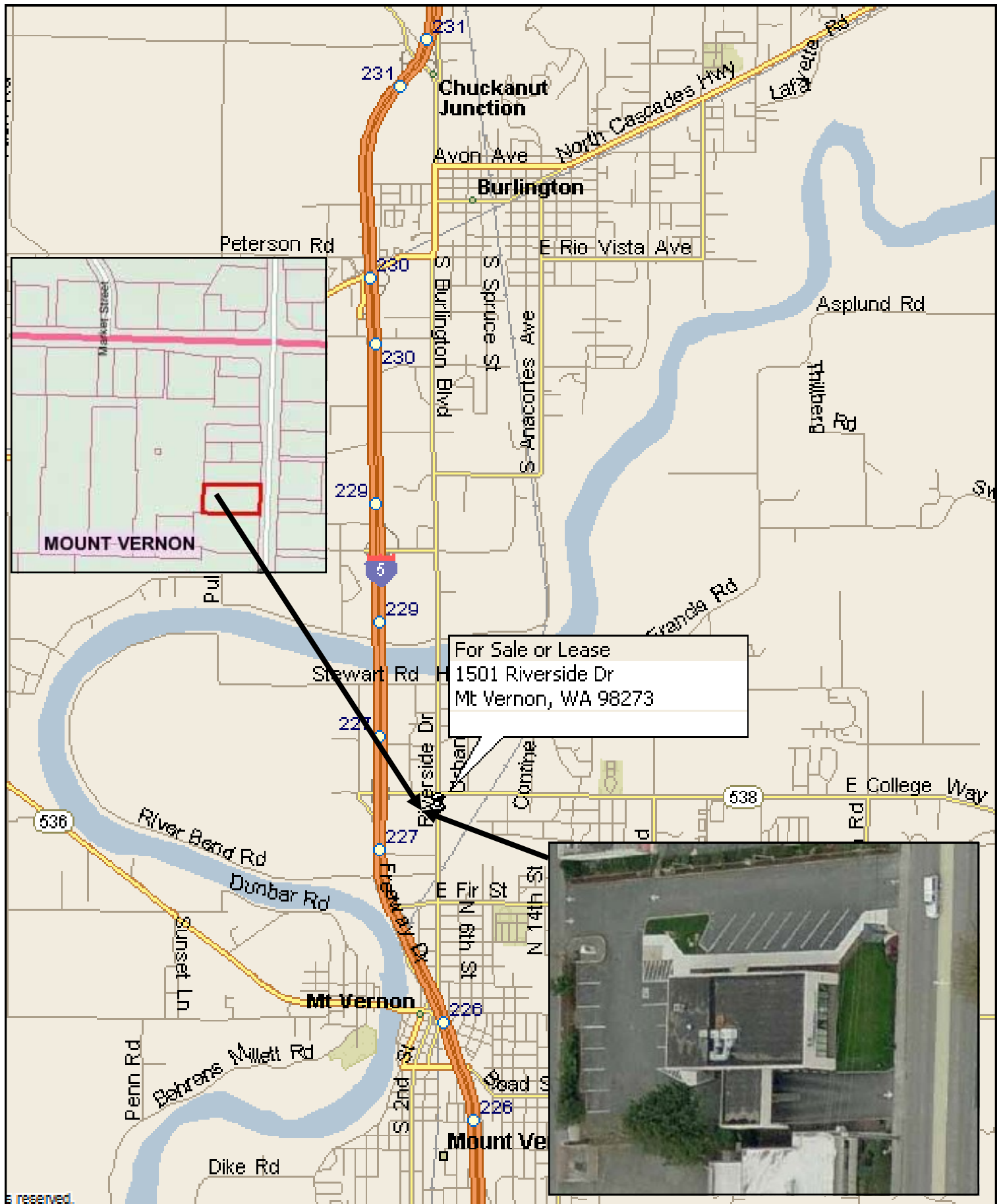
Map, Aerial Photo and Plot Plan